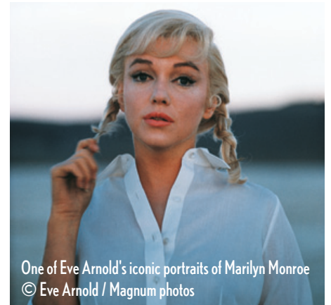
One of Eve Arnold's iconic portraits of Marilyn Monroe